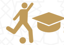
Sports & Education Investments