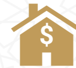
Real Estate & Commercial Investments