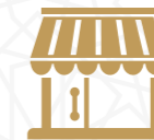
F & B and Retail Investments