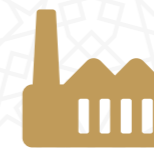
Trade & Industrial Investments