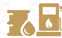
Oil & Natural Gas Investments